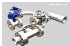
Structural & Piping detailing